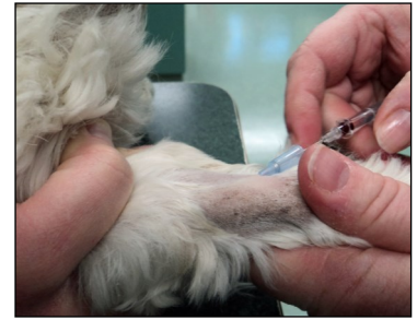
Placing the I.V. catheter.

1. An intravenous catheter is placed and we use it to administer the anesthetic drugs, give IV fluids to help maintain your pet's blood pressure, and also as a port for other medications should the need arise during the procedure.