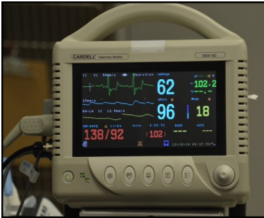
Monitoring the patient under anesthesia.

2. Your pet is then given its induction drugs which will put your pet under anesthesia. An endotracheal tube is placed to deliver oxygen and maintenance anesthetic gas. This tube will also help to prevent tartar and other foreign material from entering your pet's lungs.